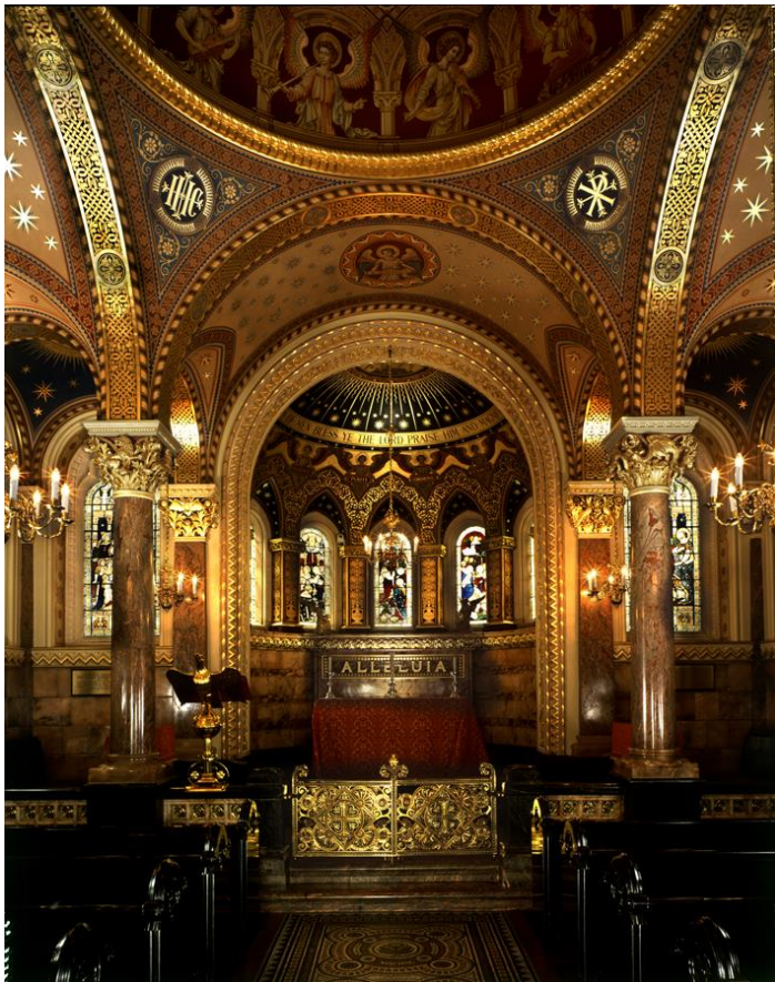
The chapel as it looks today

The Chapel continues in use today, and under normal circumstances is open all hours for patients, families and staff to access. It is also licenced for most church functions.