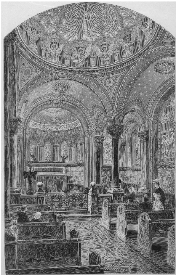
Engraved version of A.H. Haig's painting of the Chapel, from 'The Builder', 1876

The Hospital for Sick Children at Great Ormond Street opened in 1852 in a converted 18th Century townhouse on the corner of Powis Place, but did not have a purpose-built building until one was built along Powis Place using the back garden space of Nos.48-49 Great Ormond Street, opening in 1875. The only surviving part of this, although not in its original location as we shall discover, is its magnificent Victorian chapel. The new building was designed by Edward Middleton Barry, one of the several notable sons of the better-known Sir Charles Barry, principal architect of the Houses of Parliament. The chapel was endowed by his cousin, wealthy city broker William Henry Barry, in memory of his wife Caroline Pitman. Its cost of £60,000 was as much as the rest of the building in total, a reflection of Victorian priorities. Its opening service was conducted in November 1875 by another of Sir Charles Barry's sons, Canon Alfred Barry, Provost of King's College London and later the first Anglican Archbishop of Sydney.