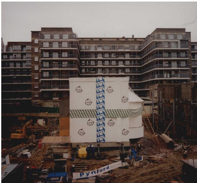
Chapel boxed during move process, November 1990

The celebrated national 'Wishing Well Appeal' of 1987-89 raised £54M to fund the construction of a new main clinical building at Great Ormond Street. This required the demolition of the 1875 clinical block, by then already shabby and crumbling. It was decided to preserve the chapel, as both still functionally required and a Grade One listed building. However, had it been left where it was, it would have been in the middle of the new clinical block, so an imaginative scheme was devised, to demolish the rest of the building around it and then underpin it and move it several hundred yards north and east. It was underpinned with a concrete base, and then gently moved on a hydraulic device over 3 days in November 1990, with Frank Bruno and a group of patients giving it a symbolic push to get the process under way. This was the first time such a task had been attempted in Britain with a brick or stone building.