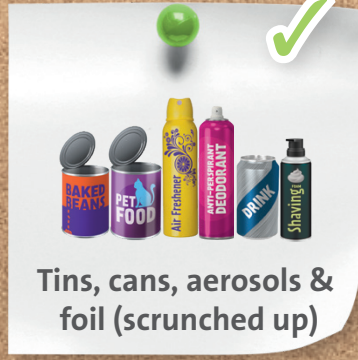
Tins, cans, aerosols & foil (scrunched up)