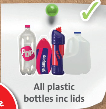
All plastic bottles inc lids