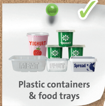
Plastic containers & food trays

Items should always be clean, dry & empty