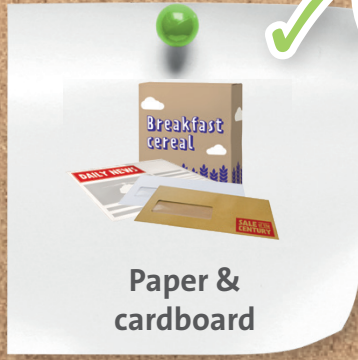
Paper & cardboard