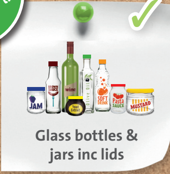
Glass bottles & jars inc lids