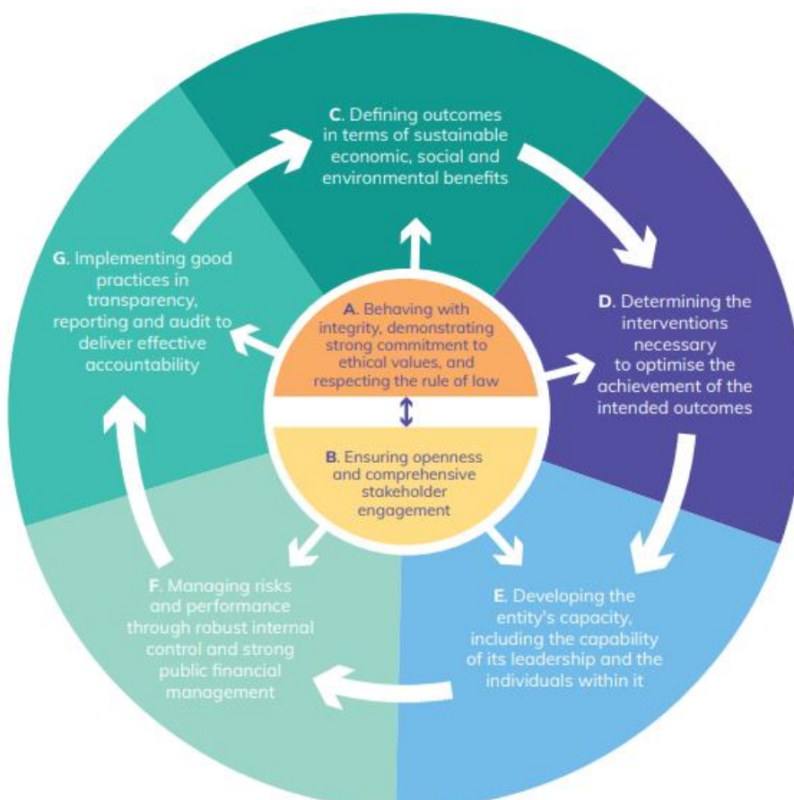
Figure 1 – Delivering Good Governance Core Principles