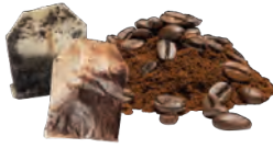
Tea bags and coffee grounds