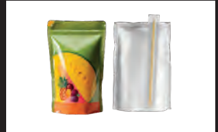
Food and drink pouches