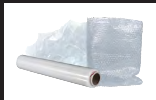
Plastic film and cling film

Do not leave rubbish next to your bin or chute