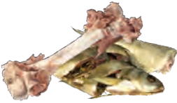
Meat, fish and bones