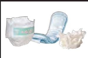
Nappies, tissues and sanitary items