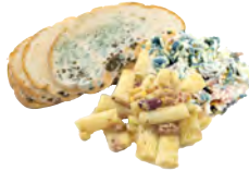
Bread, pasta and rice