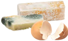
Eggs and dairy products