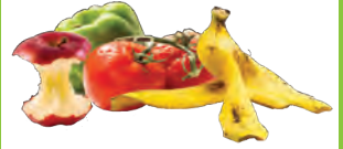
Fruit and vegetables