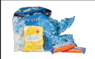
Food wrappers and packets