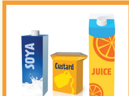
Food and drink cartons ✓

✓ Yes please Put these items in your orange rubbish bag