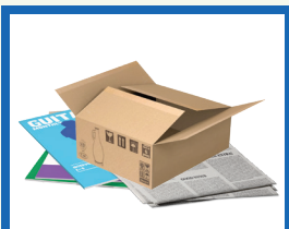
Paper and card ✓