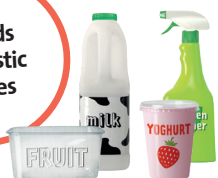
Plastic bottles and containers ✓