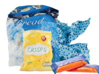
Food wrappers and packets ✓

✓ Yes please Put these items in your orange rubbish bag