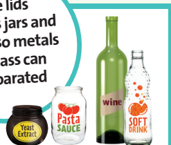
Glass bottles and jars ✓

Take lids off glass jars and bottles so metals and glass can be separated