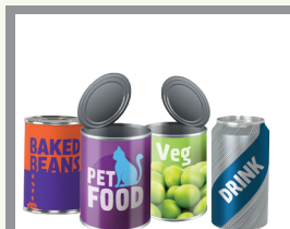
Food and drink cans ✓