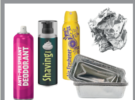
Aerosols and foils ✓