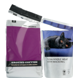
Food and drink pouches ✓