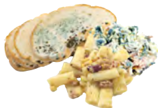
Bread, pasta and rice