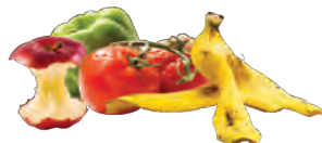
Fruit and vegetables