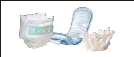
Nappies, tissues and sanitary items