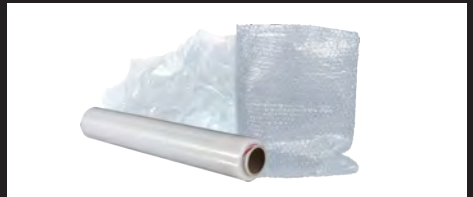
Plastic film and cling film