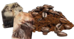
Tea bags and coffee grounds