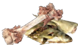
Meat, fish and bones