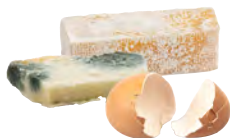
Eggs and dairy products